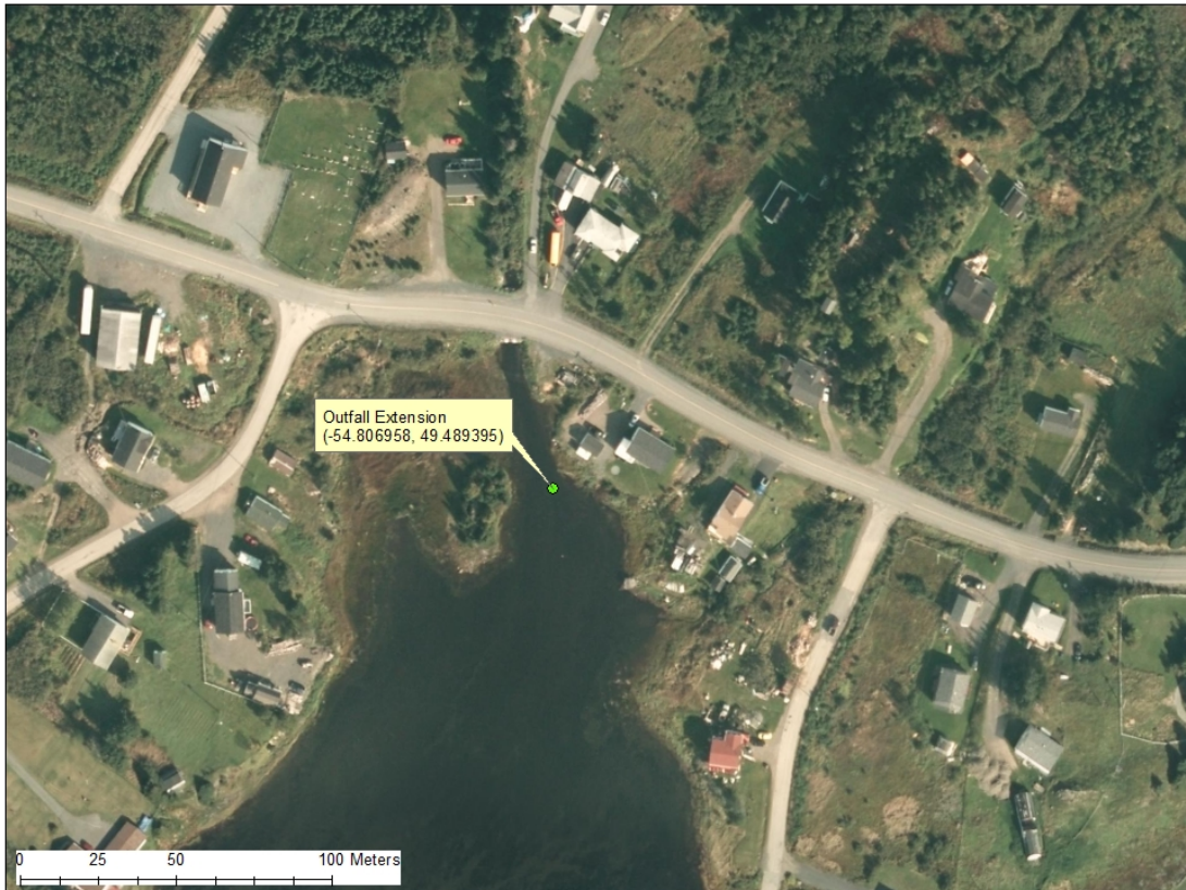
Summerford Lift Station Retrofit - Outfall Extension and Infilling