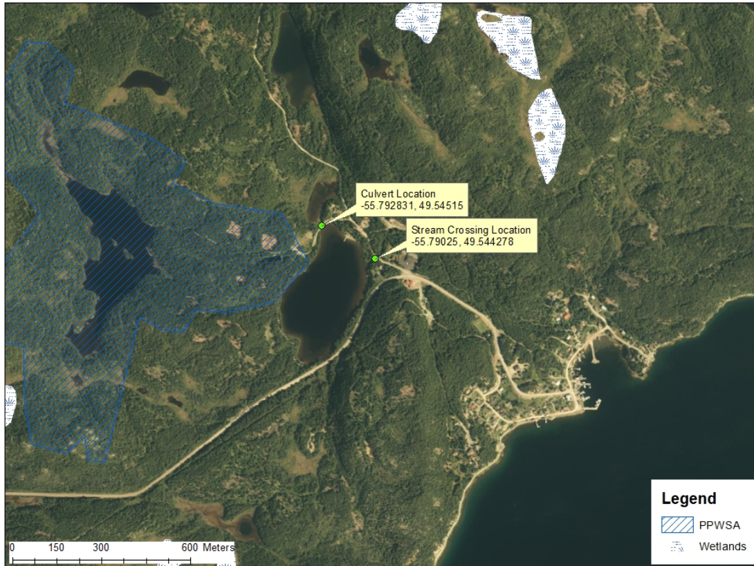
Town of Miles Cove (Miles Pond) - Watermain Replacement