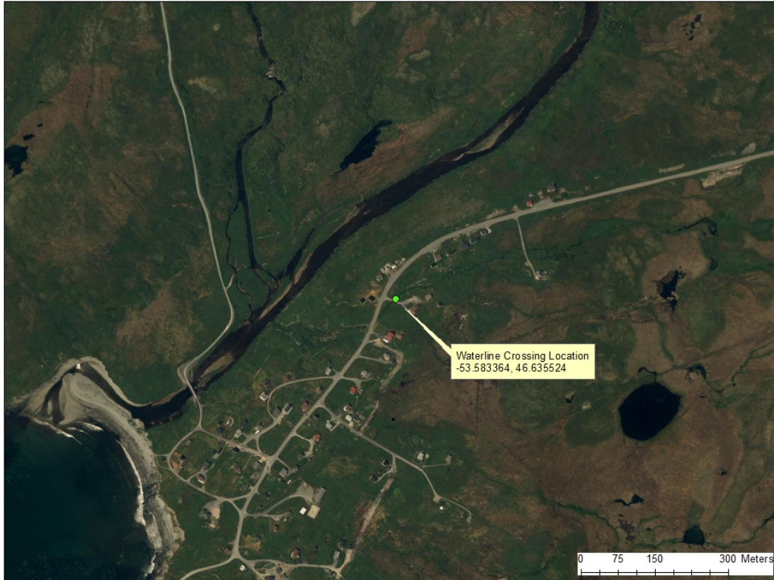
Town of St. Shotts (Larry's Gulley) - Watermain Replacement