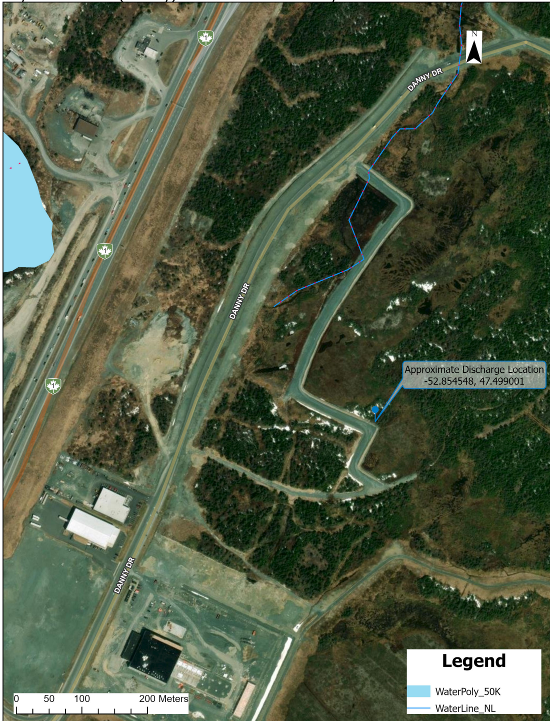
City of St. John's (Galway) - Beaumont Hamel Way - Stormwater Outfall in Wetland