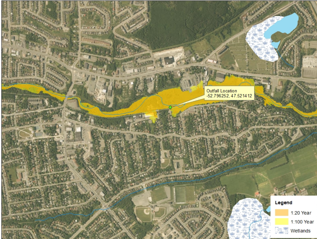
City of Mount Pearl (Waterford River) - Stormwater Outfall in Flood Plain