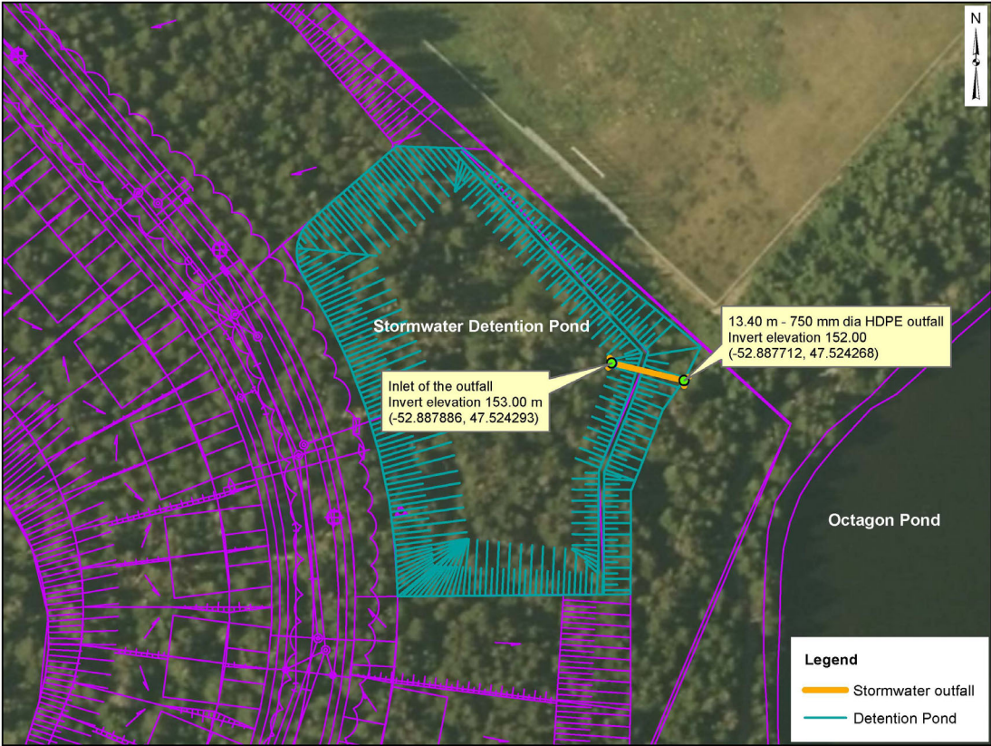
Construction of stormwater detention pond and outfall in Emerald Ridge Subdivision in Paradise