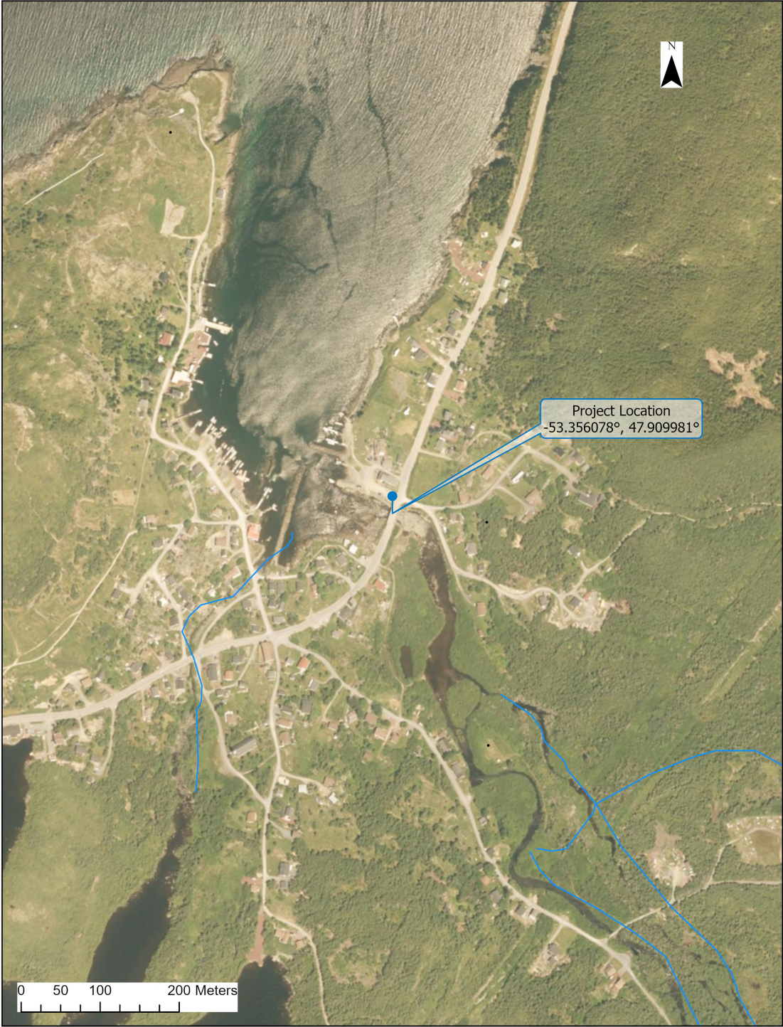
Town of New Perlican - Water Main Relocation