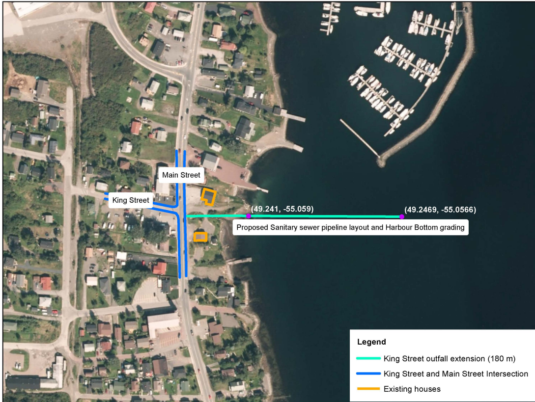
King Street Outfall Extension in Lewisporte