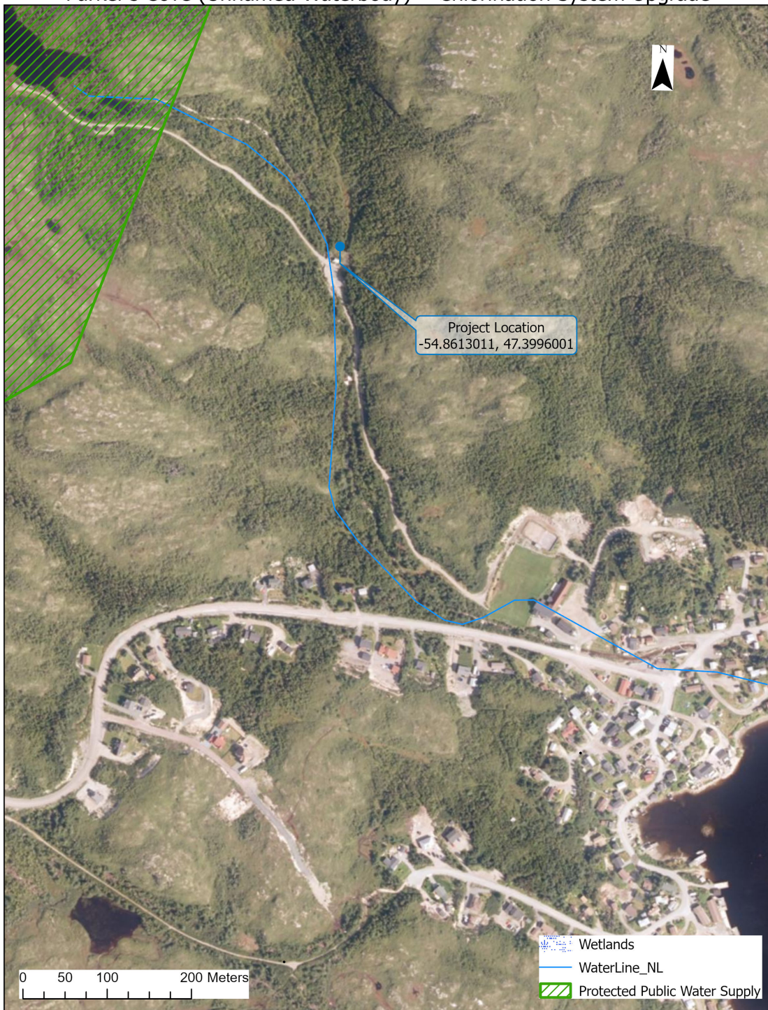
Parker's Cove (Unnamed Waterbody) - Chlorination System Upgrade