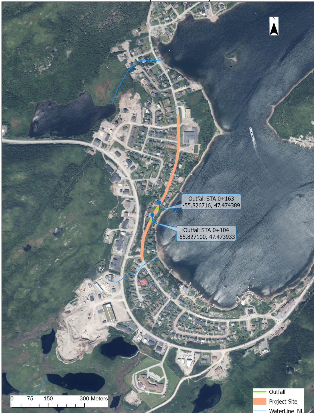
Harbour Breton - Watermain Replacement - Bay D' Leau Drive North