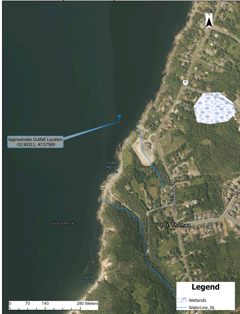
Town of Paradise (Bell Island Tickle) - Wastewater Treatment Outfall Repairs