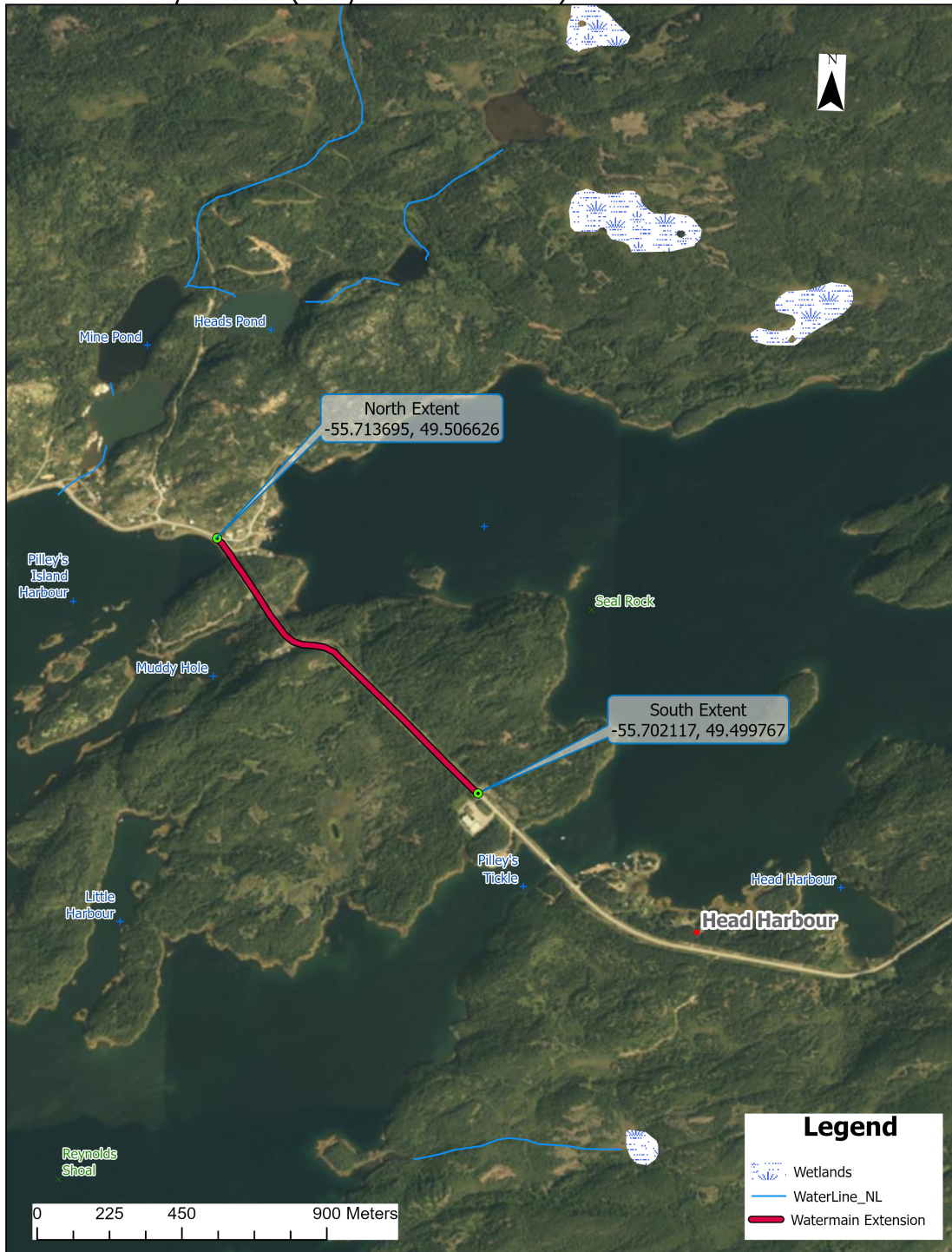
Pilley's Island (Pilley's Island Harbour) - Watermain Extension