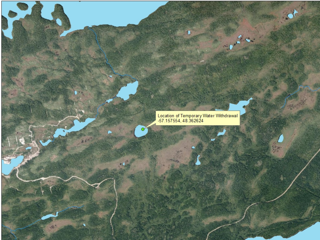
Location of Temporary Water Withdrawal for Temporary Concrete Batch Plant