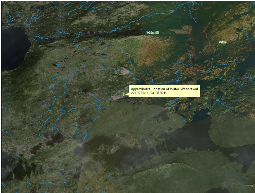
Aurora Energy Ltd - Camp - Water Withdrawal Location