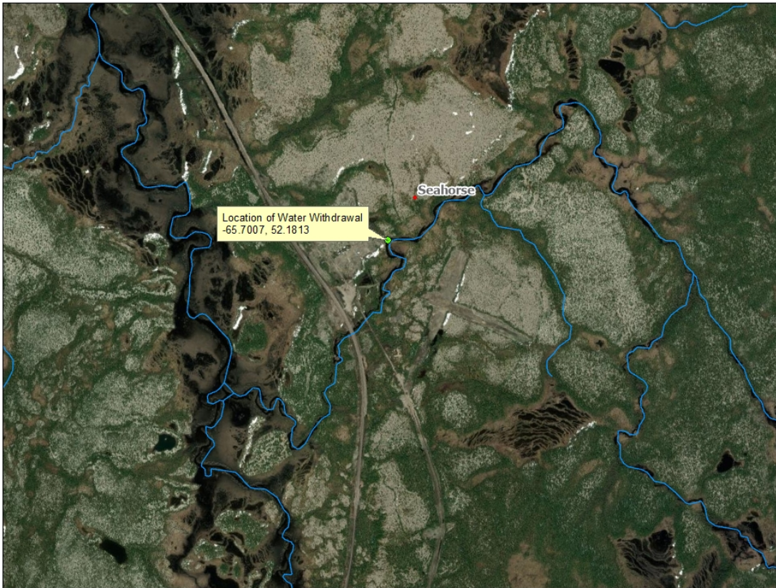
Location of Water Withdrawal - Seahorse Camp