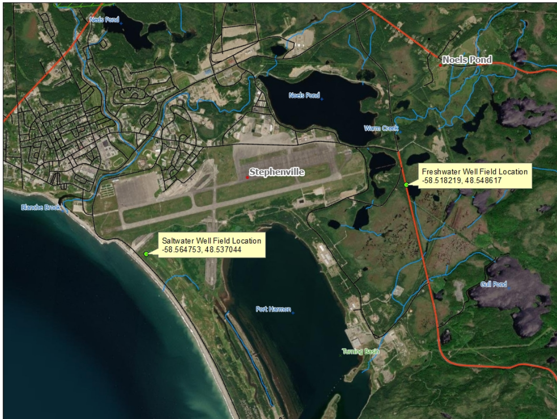
Northern Harvest Smolt - Recirculating Aquaculture Hatchery - Water Withdrawal Locations