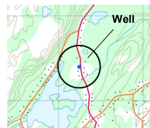
Groundwater catchment area