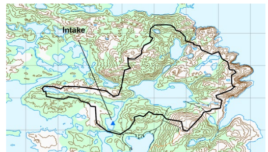
Surface watershed area