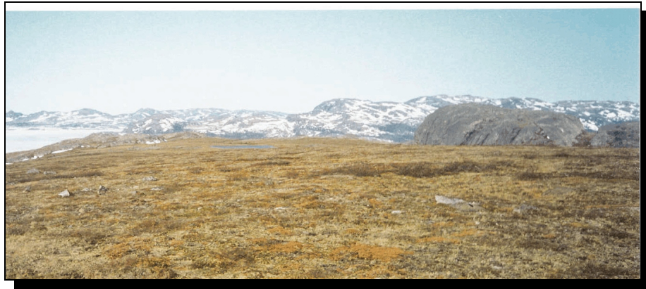
North Facing Shot: Out towards Unity Bay (above).