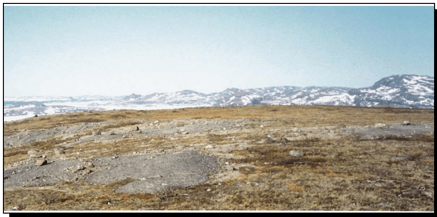
North Facing Shot: Mossy overstory with quartz granite Bedrock (below).