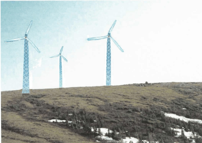
East Facing conceptual computer aided drawing.