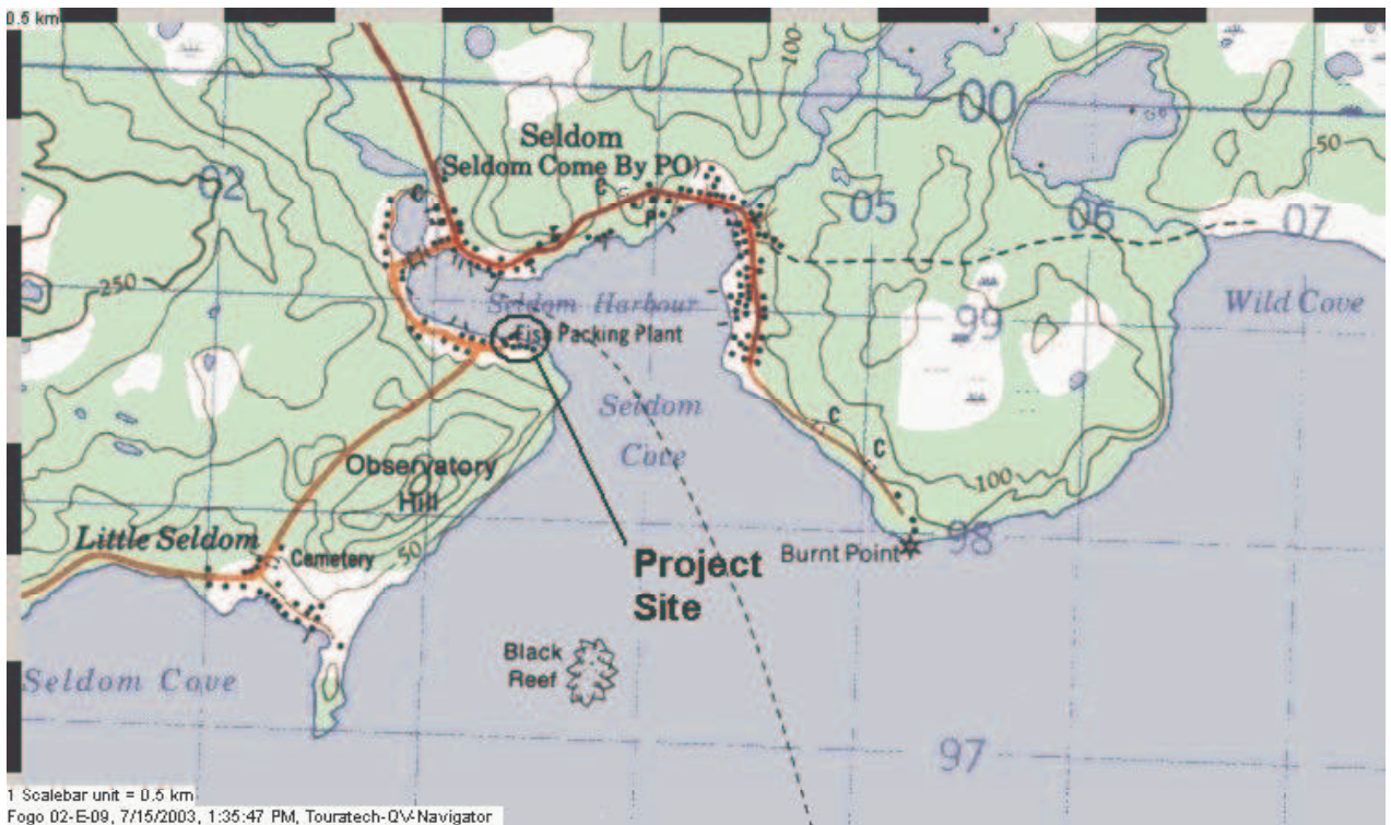
1 Scalebar unit = 0.5 km Fogo 02-E-09, 7/15/2003, 1:35:47 PM, Touratech-QVNavigator