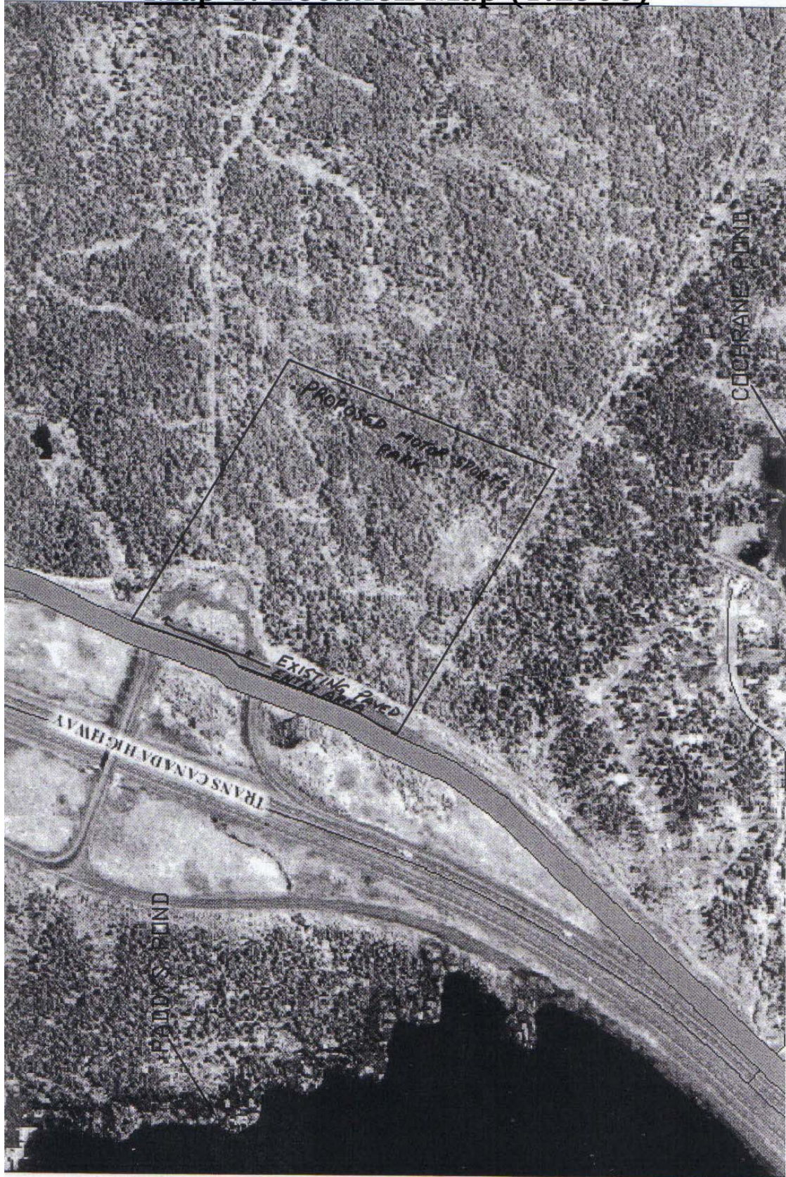
Map 1: Location Map (1:2500)