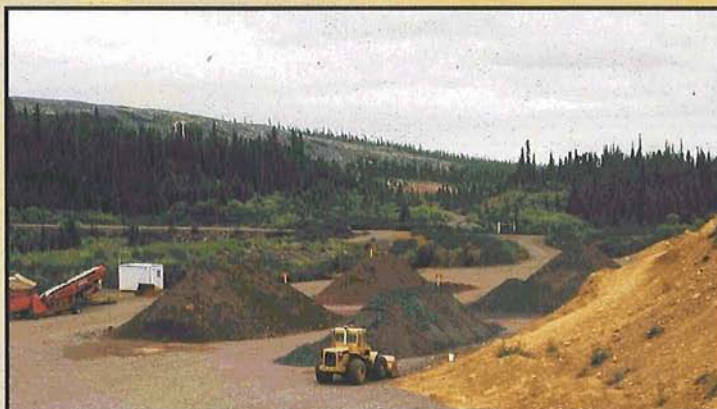
Bulk sample stockpiles at Silver Yard

LIM is committed to developing the James and Redmond deposits in a socially and environmentally sustainable manner and has demonstrated this commitment through the early initiation of environmental baseline data collection (2005 to present), traditional knowledge gathering program, undertaking of an Environmental Impact Study, development and training programs for local workers, and maximization of economic benefits to Labrador.