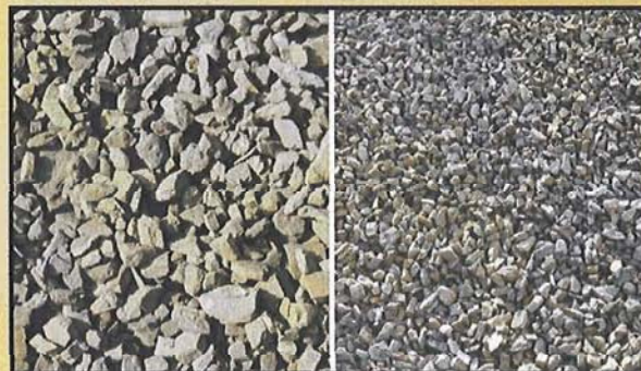
Lump ore products, James (left) and Houston (right)