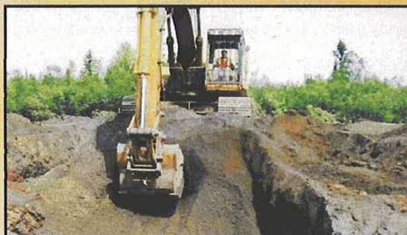
Bulk sampling at James Deposit