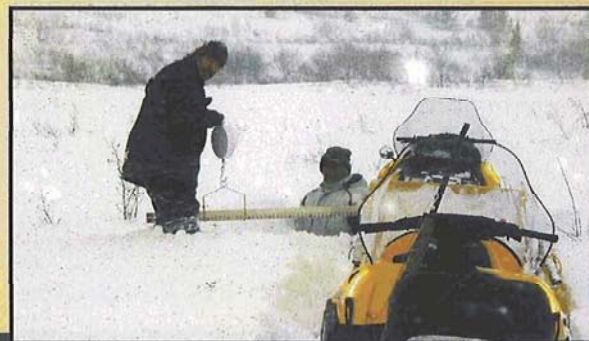
Environmental Baseline Studies