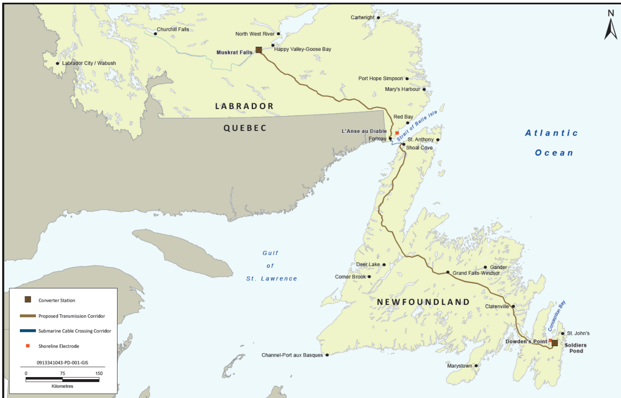
Figure 6-1 Labrador-Island Transmission Link (Nalcor 2012)