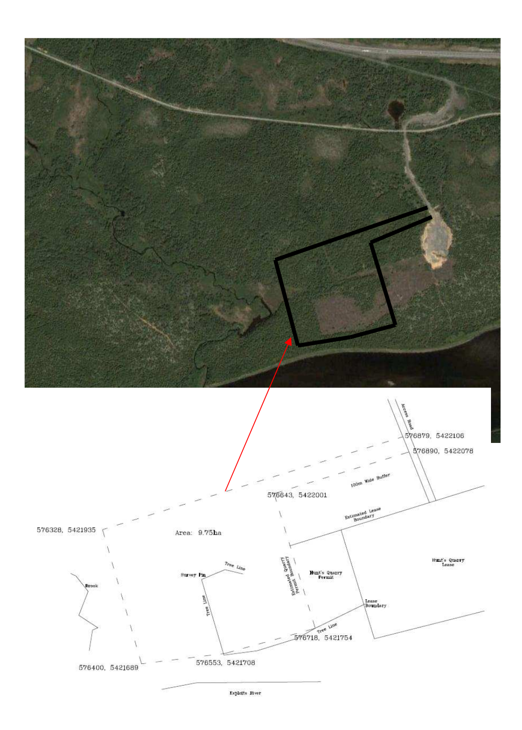
Figure 2. Pit Location