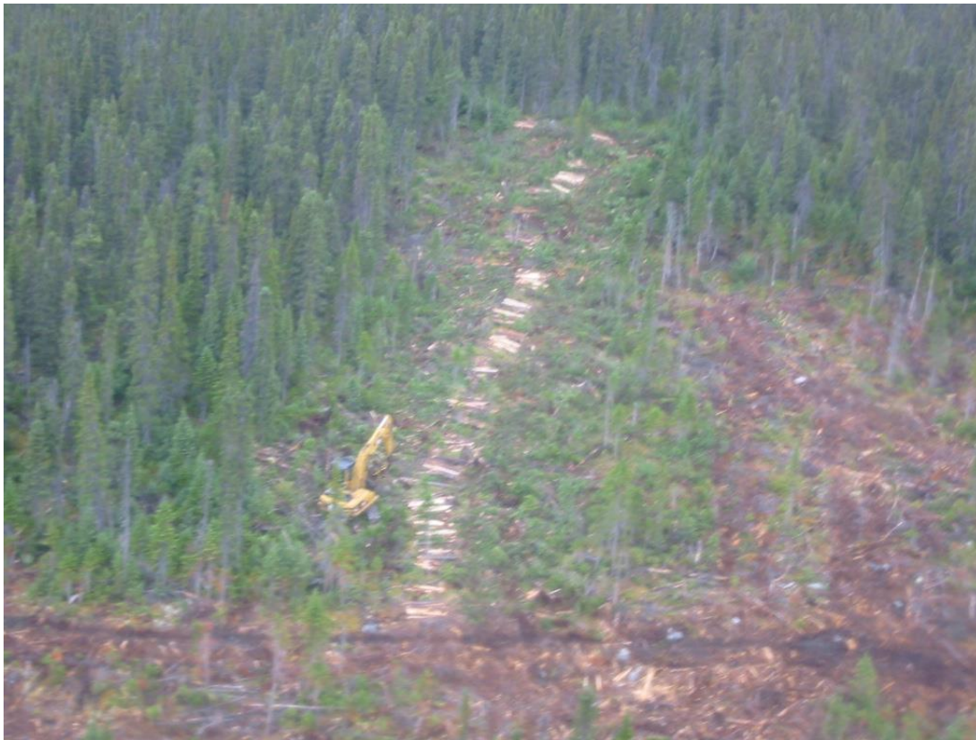
Figure 2.2: Mechanical harvesting operation near Postville, Nunatsiavut (2008).

FMD 23 is generally contiguous spruce/fir with the exception of some large burns in the Kaipokok area. One road is located to the west of the community of Postville. Past forest harvesting operations were conducted by manual felling and snowmobile hauling, which had minimal impact on the forest condition. More recent harvesting operations, (since the early 2000's), has seen the introduction of a more mechanized harvest, with the introduction of harvesting with a mechanical harvester and skidder. This may have caused additional disturbance to the forest floor (Figure 2.2).