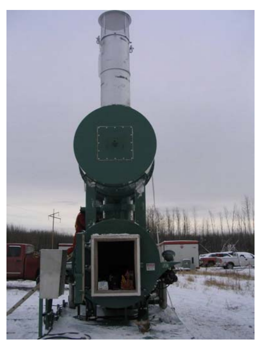
Figure 2.2 Typical Controlled Air Dual Chamber Incinerator