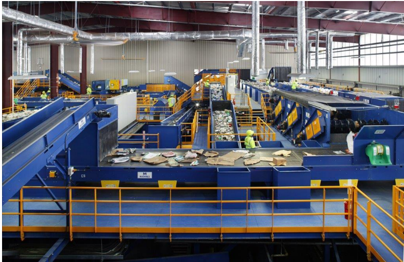
Material Recovery Facility (MRF) Winter 2014

The Regional Service Boards Act, 2012 is available online through the following website: www.assembly.nl.ca/legislation/sr/statutes/r08-1.htm.