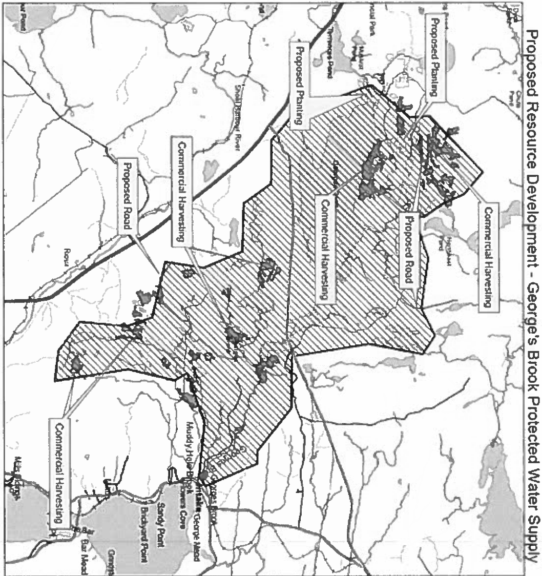
Proposed Resource Development - George's Brook Protected Water Supply