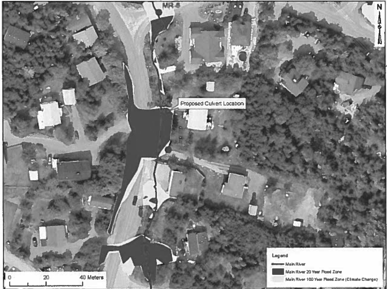
The Town of Portugal Cove - St. Philip's Flood Plain Mapping