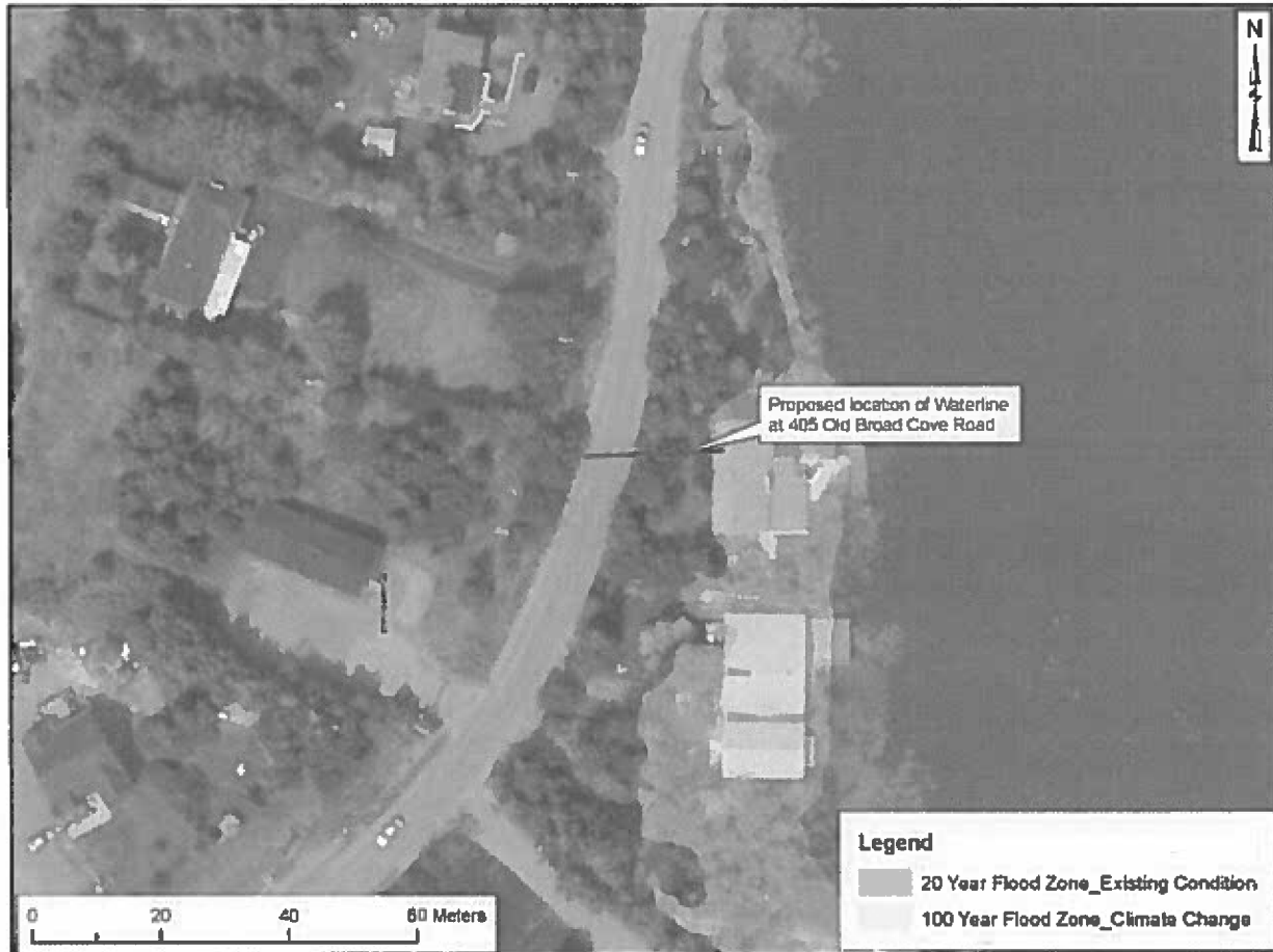
Flood Risk Map of Beachy Cove Brook in the Town of Portugal Cove - St. Philip's