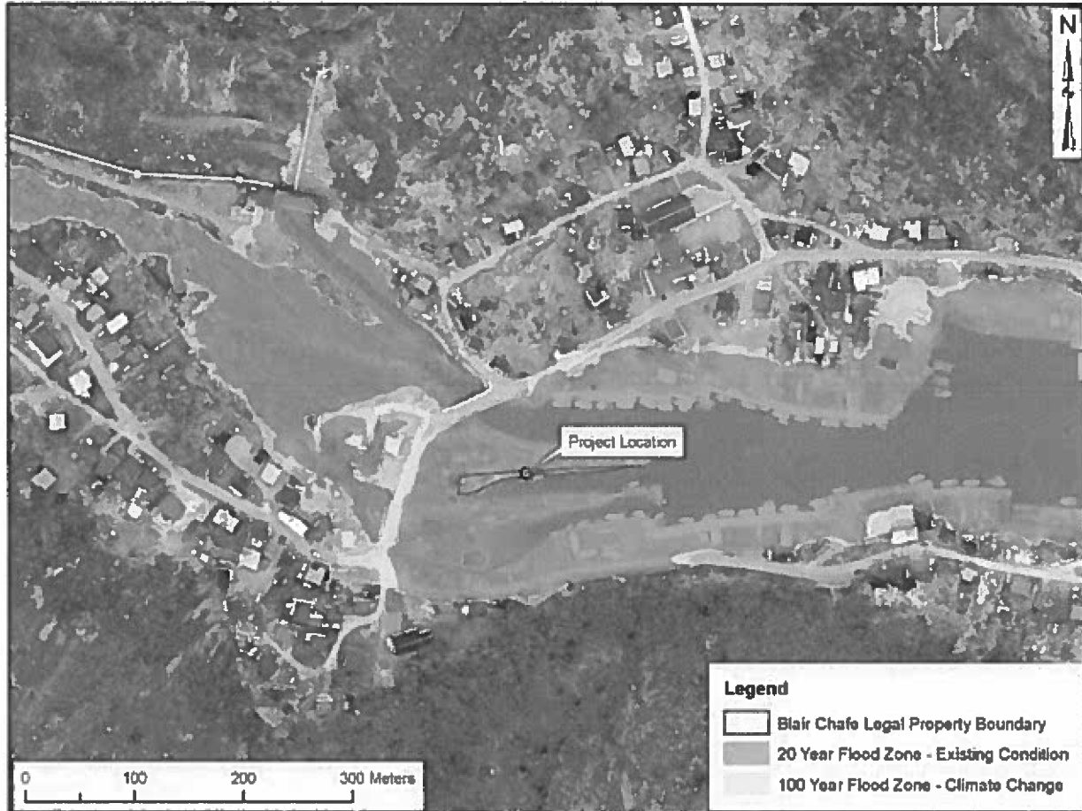
The Town of Petty Harbour - Maddox Cove Designated Flood Risk Map