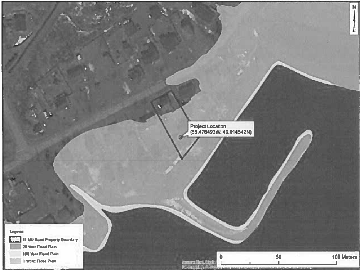
Designated Flood Plain for the Town of Bishop's Falls