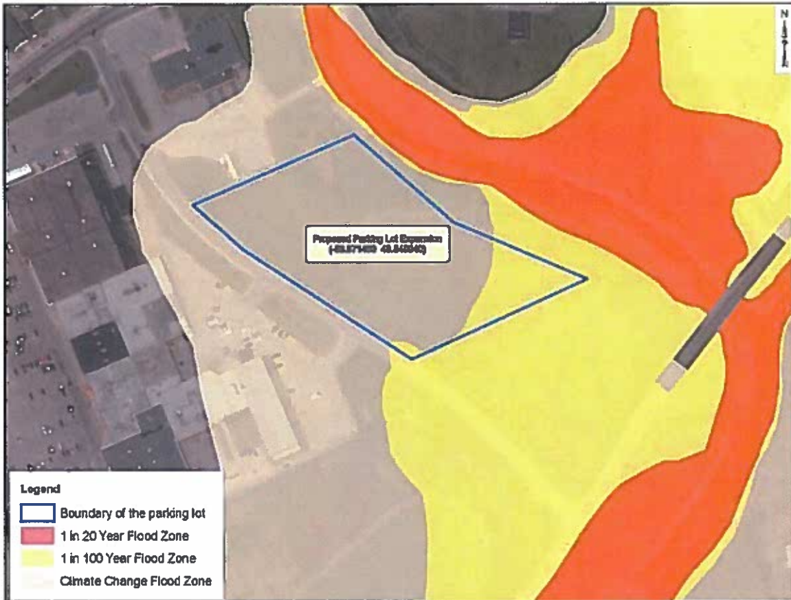
Revised Location Map of Parking Lot Expansion