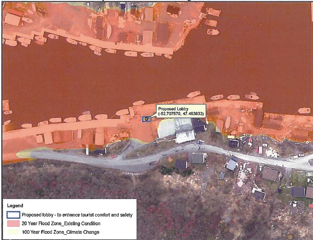
Town of Petty Harbour/Maddox Cove designated flood risk area