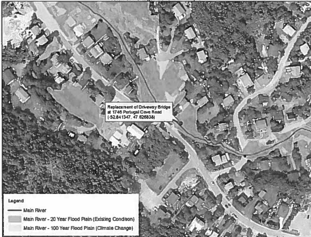
1746 Portugal Cove Road Driveway Bridge Town of Portugal Cove-St. Philip's