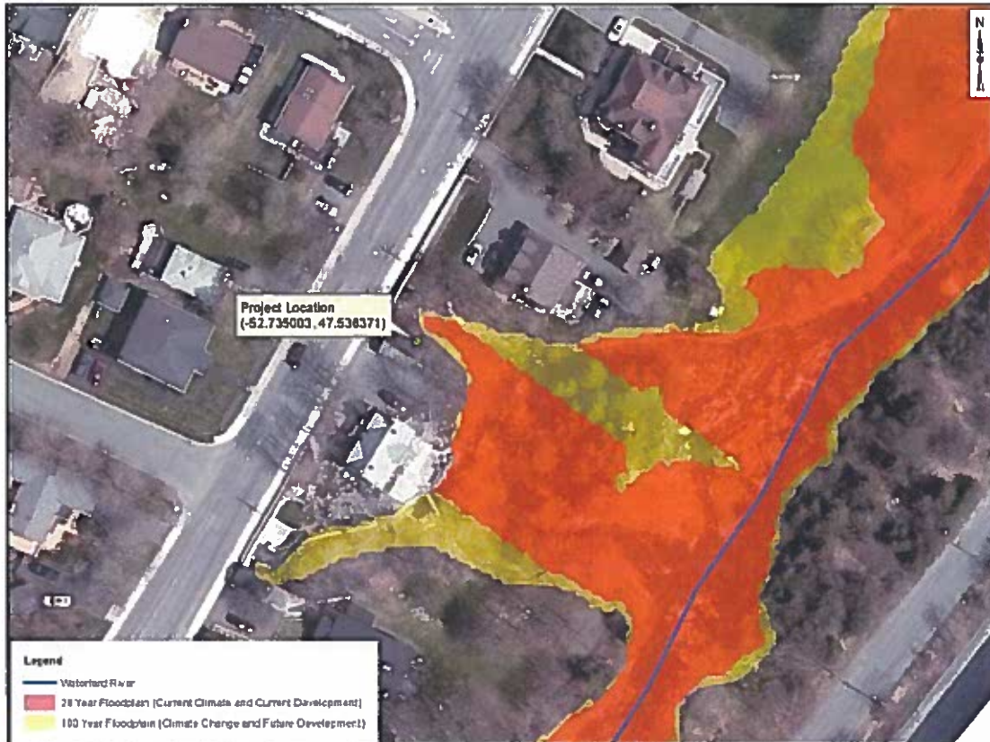
Waterford River Flood Risk Mapping