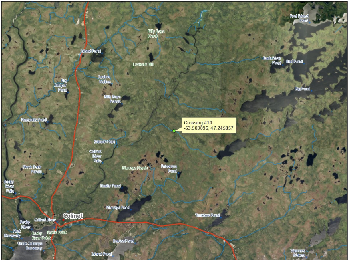
ALT12908-2023 - Amendment #1 - Crossing #10