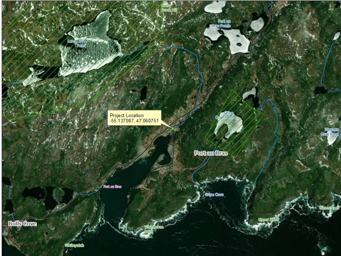
Port Au Bras - Town of Burin - Culvert Replacement