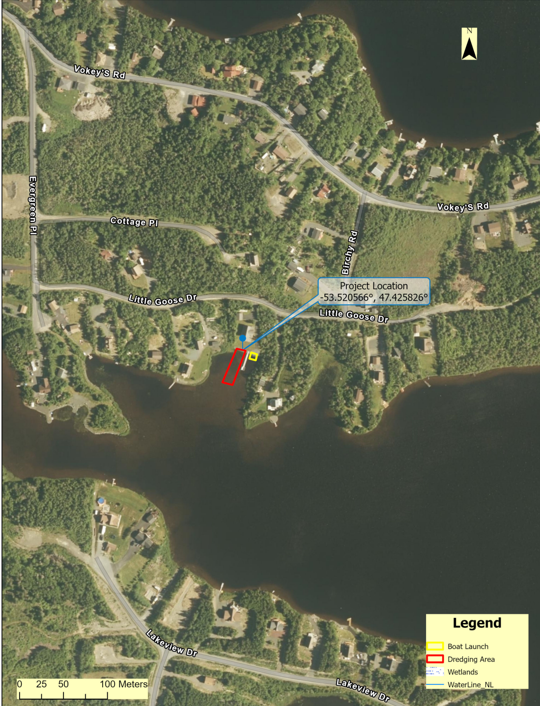
Town of Whitebourne (Little Goose Pond) - Boat Launch Construction and Pond Access