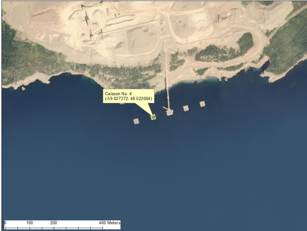
Atlantic Minerals Limited Marine Terminal Caisson No. 4 Replacement