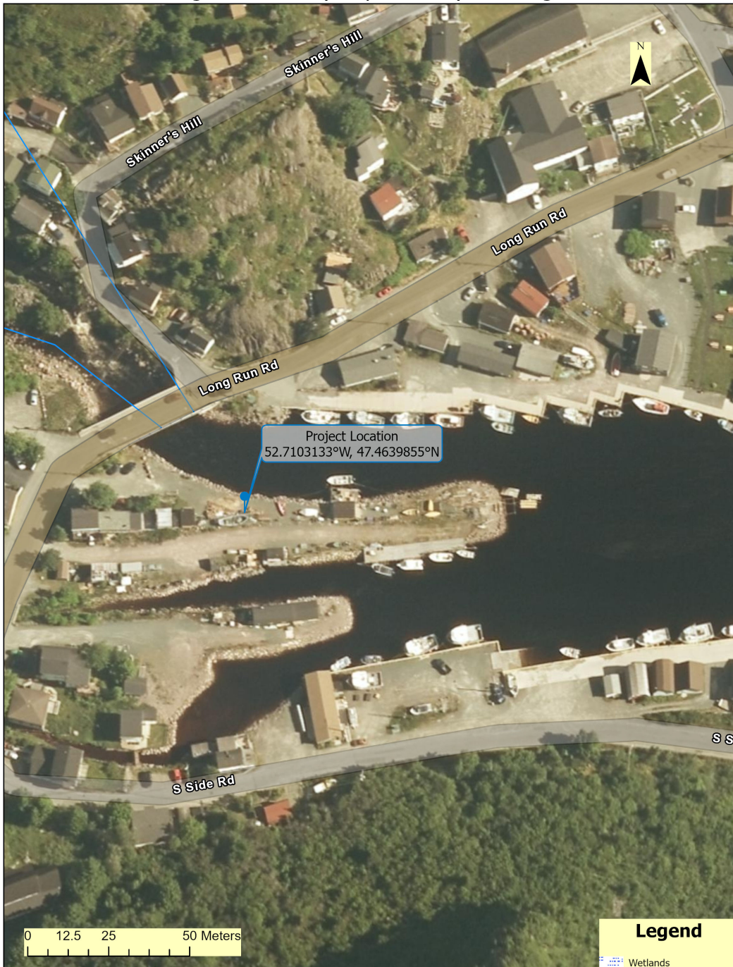
Fishing for Success (Petty Harbour) - Infilling Work