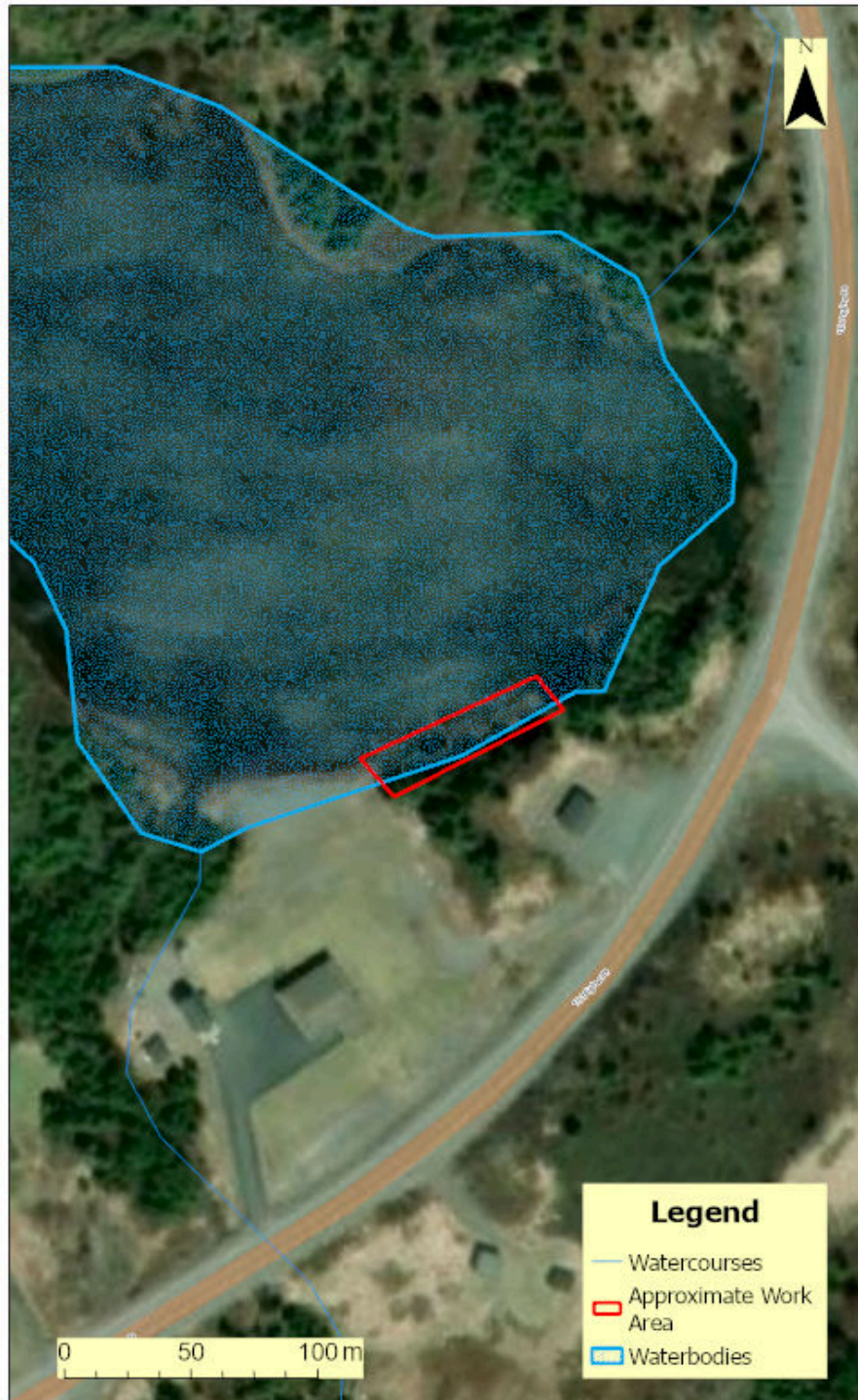
Dredging - Renews Cappahayden - Duck Pond