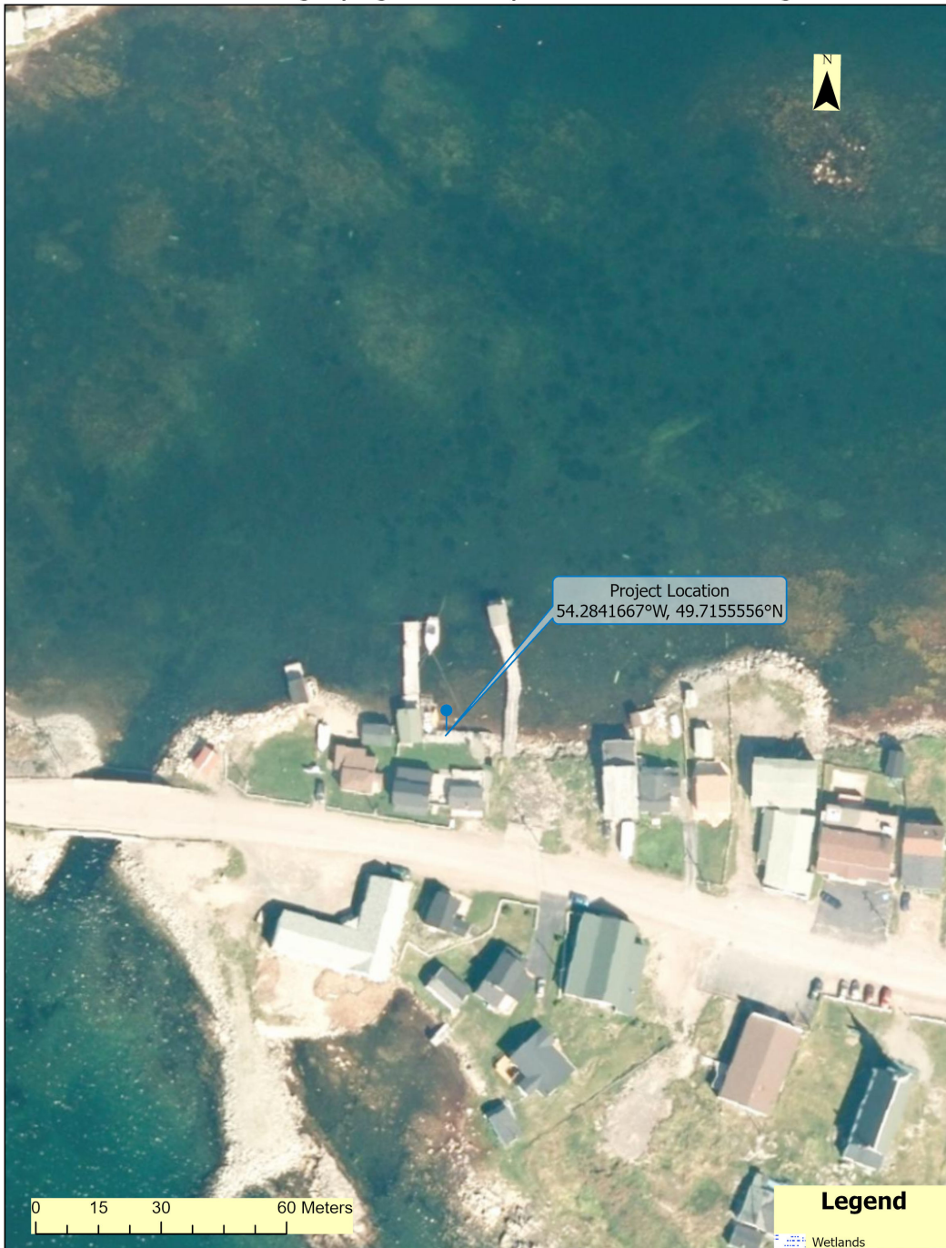
Town of Fogo (Fogo Harbour) - Shoreline Armouring