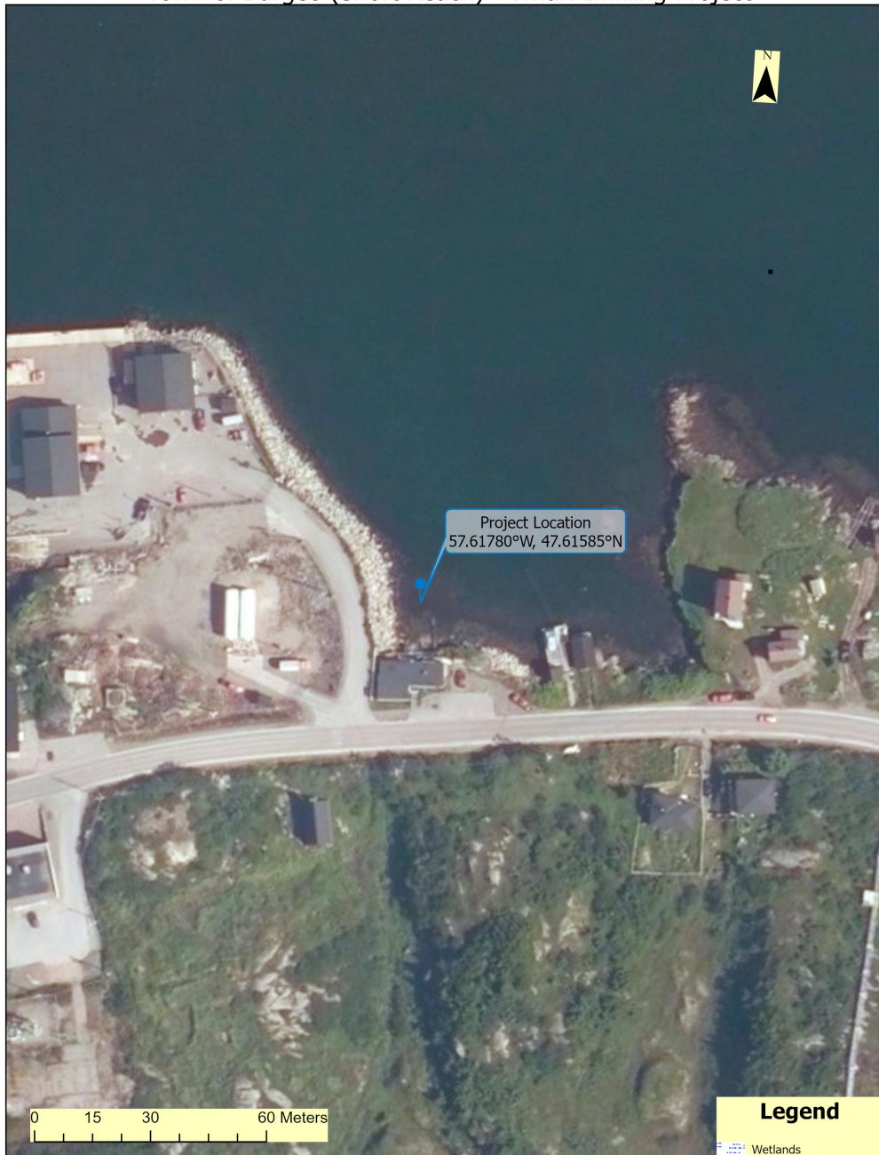
Town of Burgeo (Short Reach) - Wharf Infilling Project