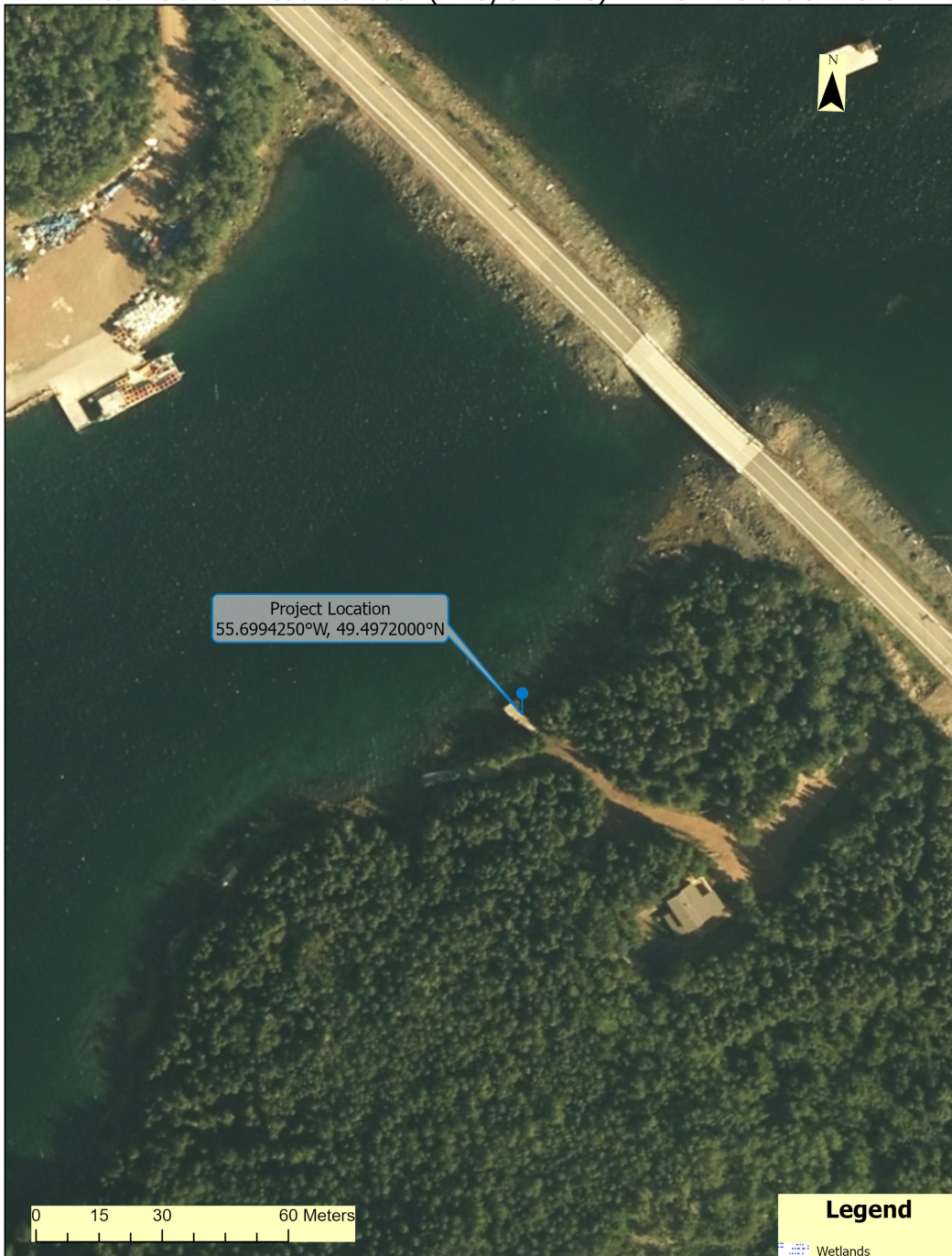
Triton Island - Head Harbour (Pilley's Tickle) - Wharf Refurbishment