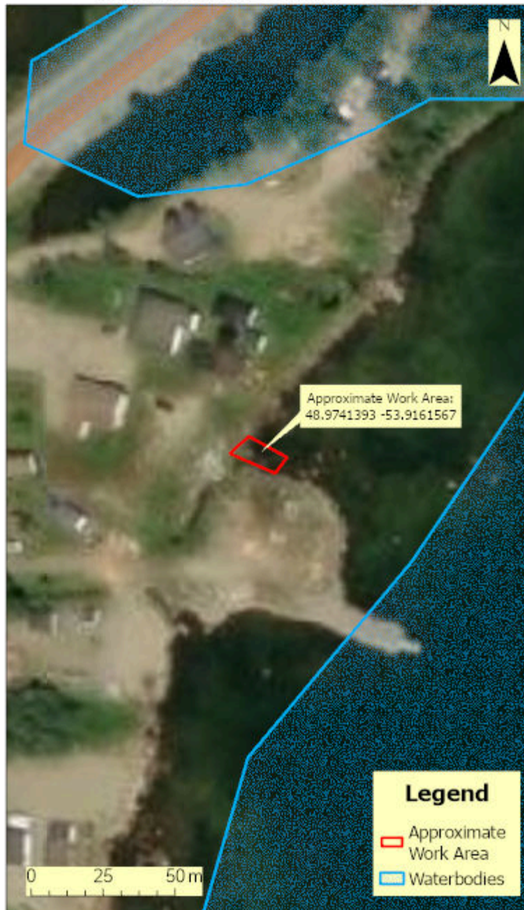
Trinity (Southwest Arm) - Infilling