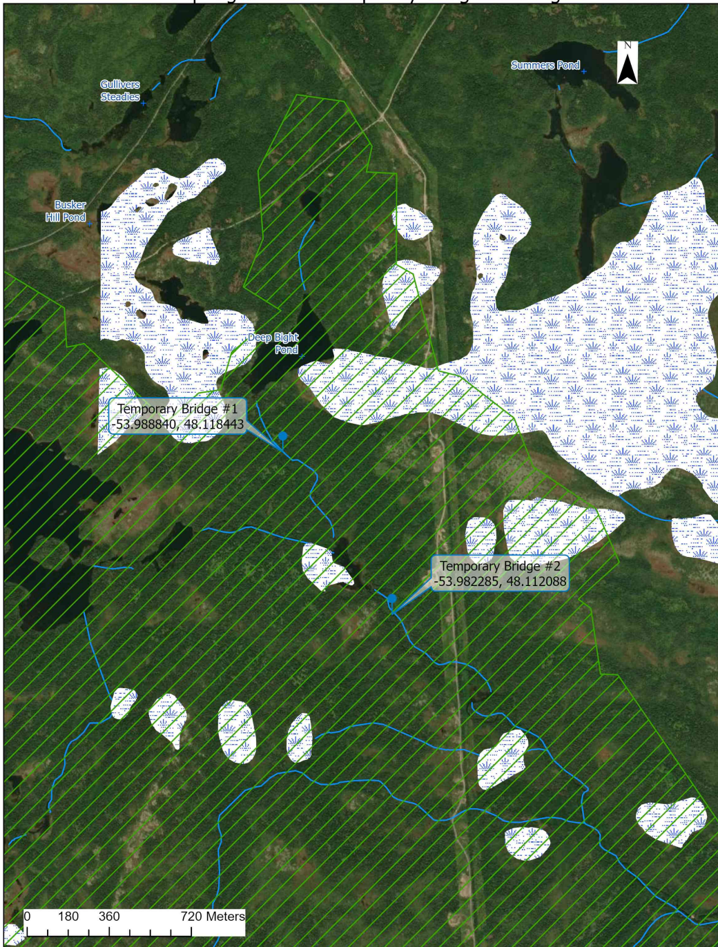
Deep Bight River - Temporary Bridge Crossings