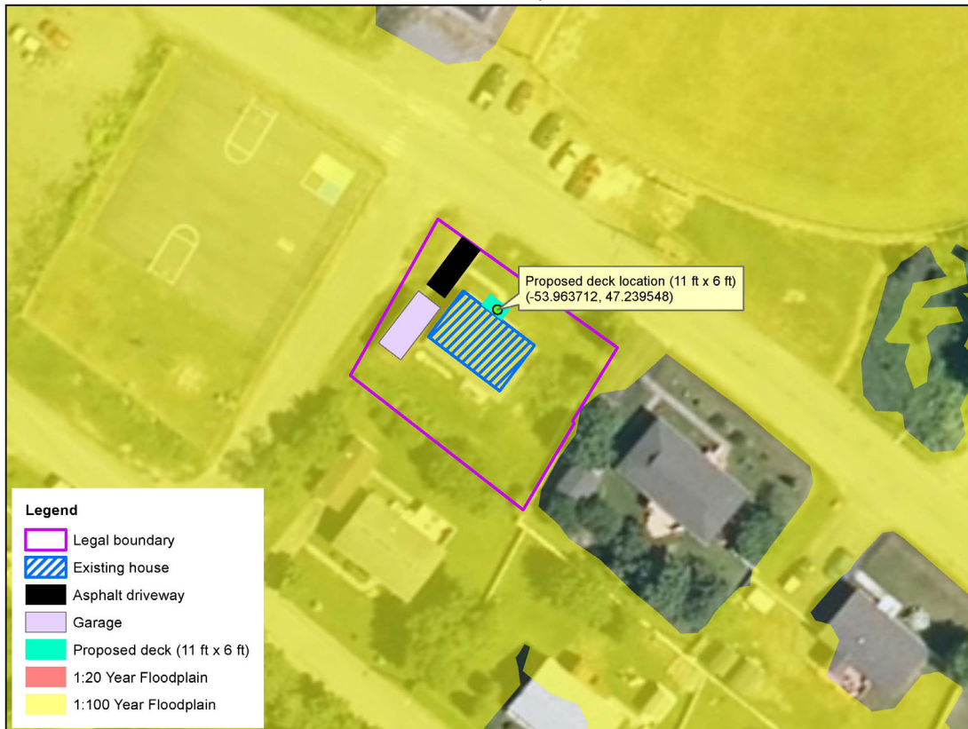
Deck construction at 16 Bruley Avenue, Placentia