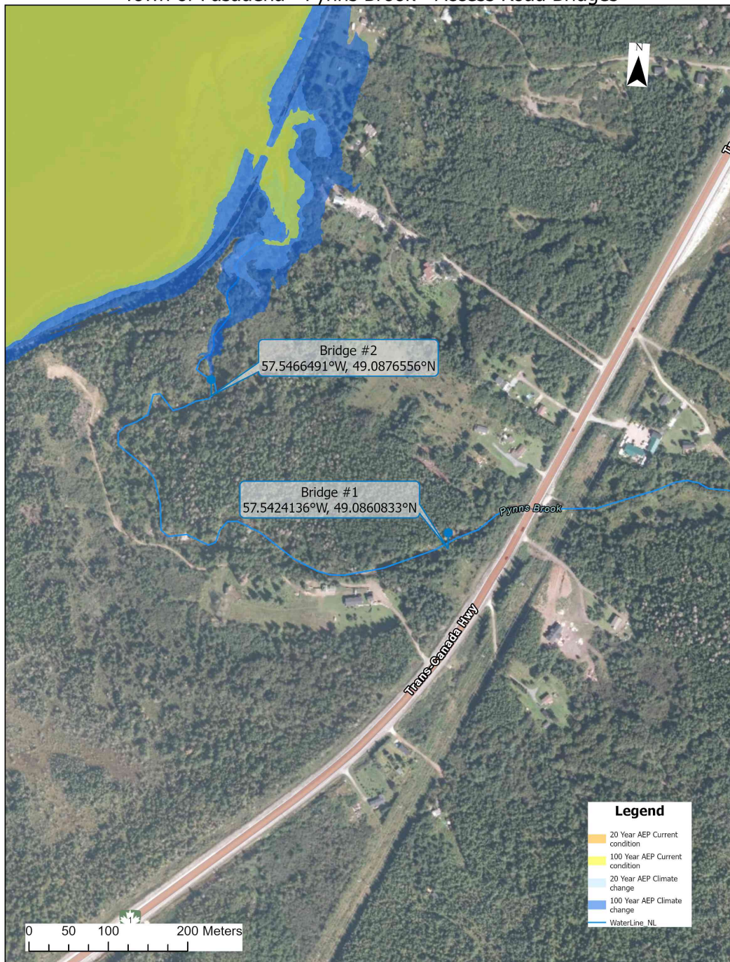
Town of Pasadena - Pynns Brook - Access Road Bridges