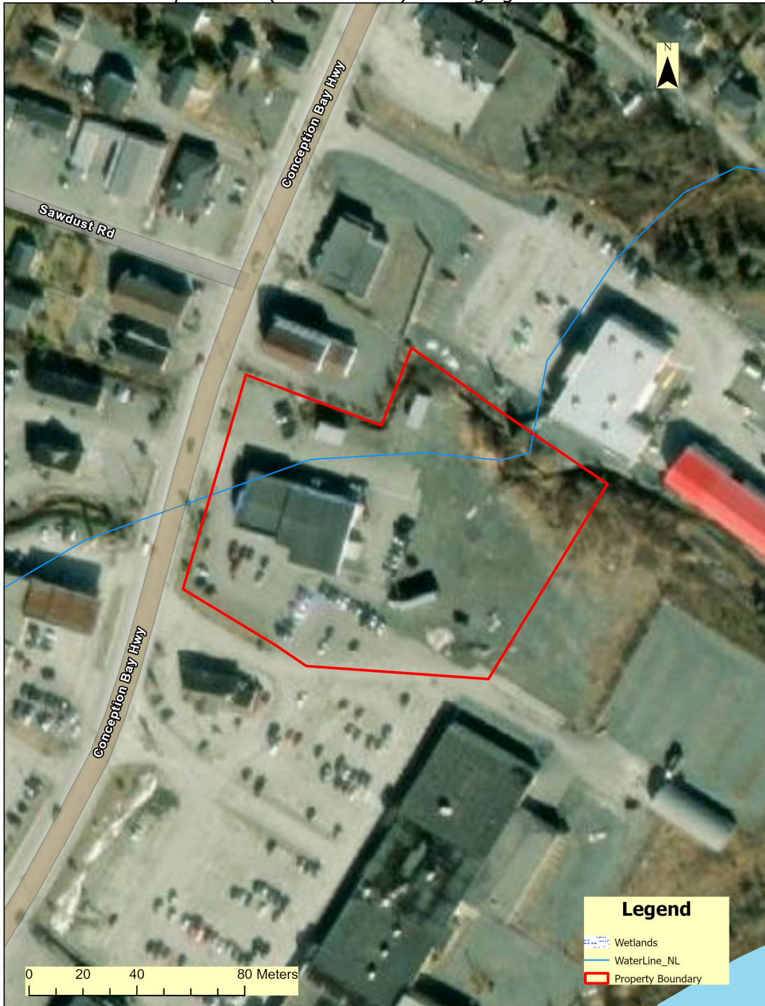
Town of Bay Roberts (Beaver Brook) - Dredging and Debris Removal